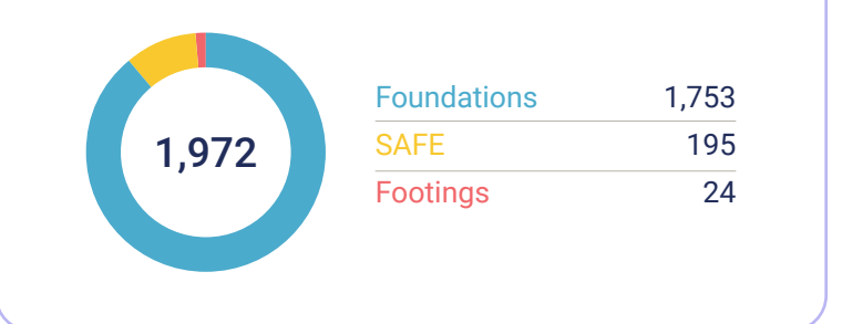
PROGRAM PARTICIPANTS SERVED